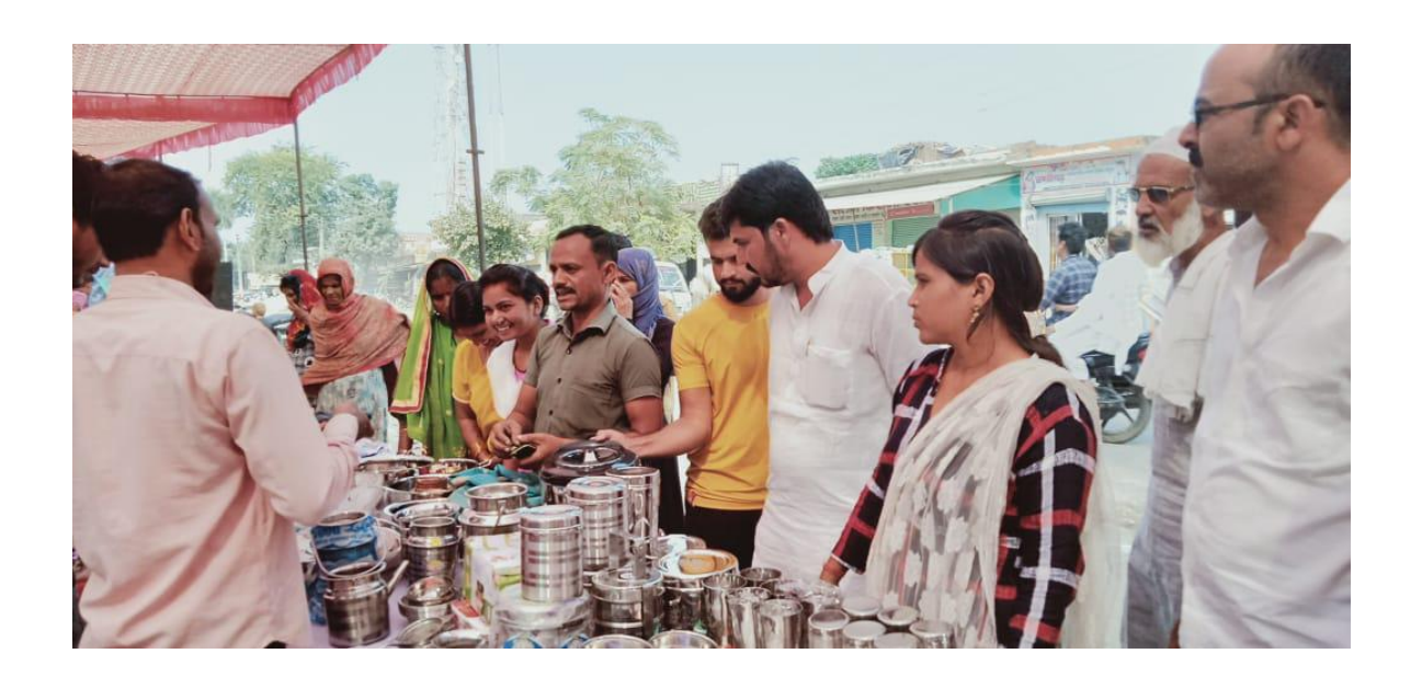
Figure 3. Utensils Shop in the Mela

The mela was inaugurated by the Panchayat President in the presence of the headmaster, BEPC members, BPM-SVEP and the entire Block Resource Center team. The total cost for organising the mela was Rs. 7600/- that has been contributed by the Cluster Level Federations of the Block, the participating Entrepreneurs and Block Resource Centre. The total revenue from the mela after two days was Rs. 59,150/-making it an average of Rs. 2820/- per entrepreneur.