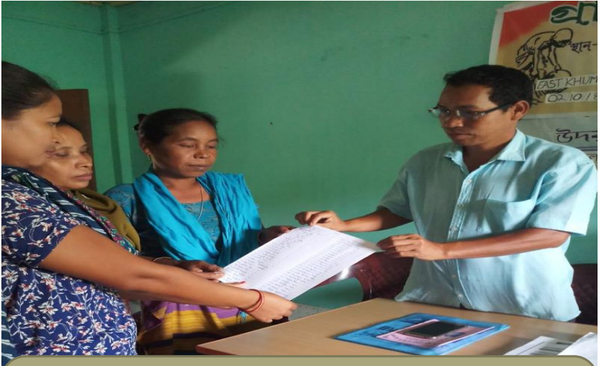
VO submitting the Demand plan to the President of Khupilong VC,Killa Block, Tripura

VO representatives presenting the entitlement demands in Gram Sabha , Salpara GP, Lawkhowa Block, Assam