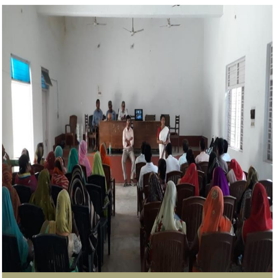
PRI-CBO Combined Orientation on Gram Sabha and GPDP, Sardar Nagar Block, Sultanpur,UP

Meeting with the AAW, ASHA conducted by VLF about GPDP and Gram Sabha in Manipur