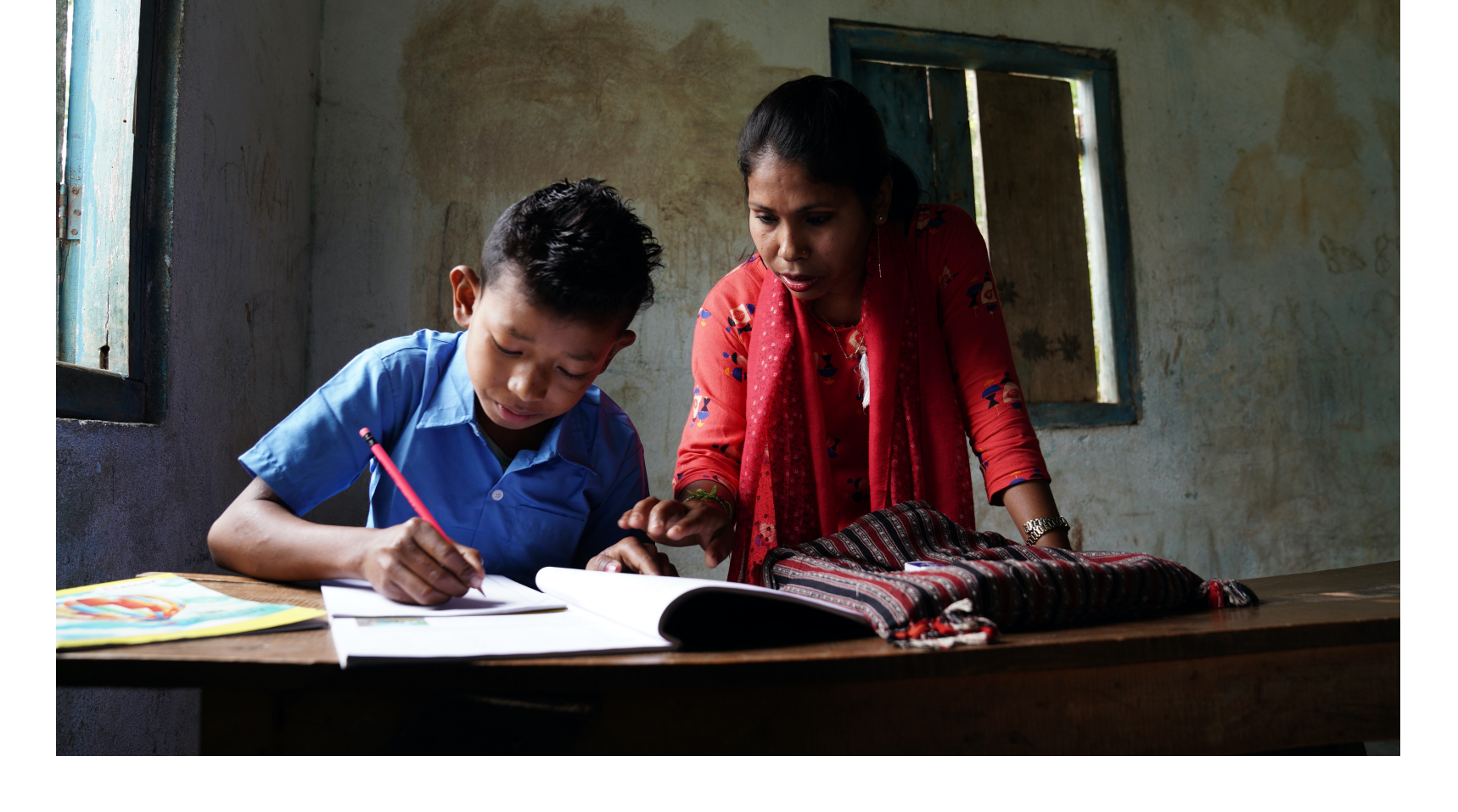
Re-enrollment of school drop-out in Karbi-Anglong district, Assam