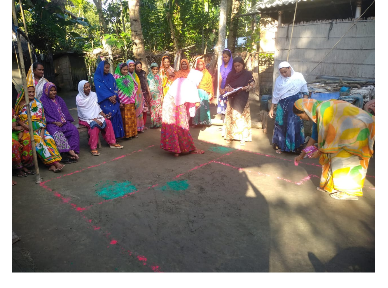
Public goods, services and resource development plan preparation in Assam