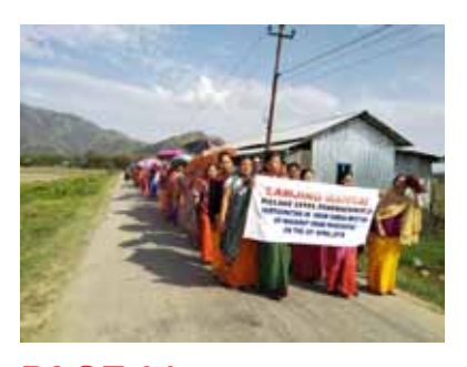
PAGE 01 Step Towards Building synergy :

Women participation in strengthening the local governance