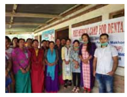
PAGE 07 Redefining Generosity SHG Women in Naharup village runs a free dental camp