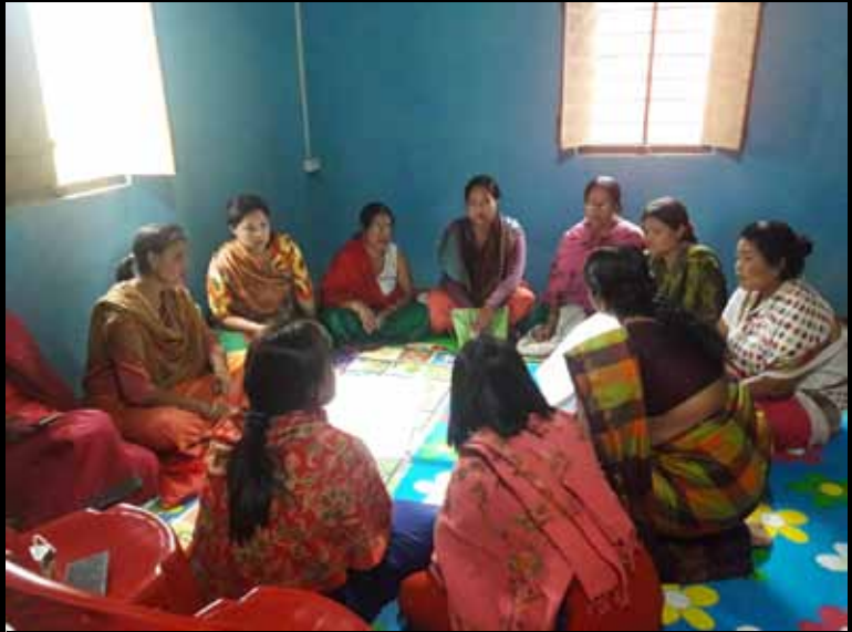
Data collection at SHG level by LRG in Top Dusara G.P, Keirao-Bitra Block