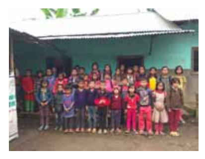
PAGE 04 My Hopes for Bright Future

The SHG women working towards creating a better future