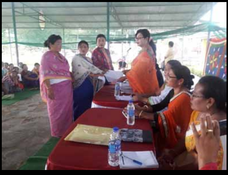
VLF submitting the Demand proposal to the Pradhan in Top Dusara G.P, Keirao-Bitra Block