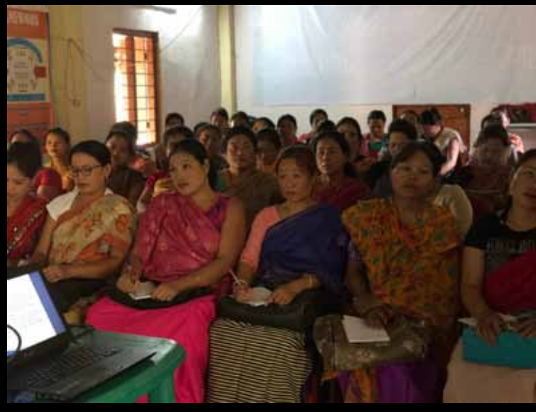
Block Level LRG orientation on GPDP & Gram Sabha in Keirao-Bitra Block