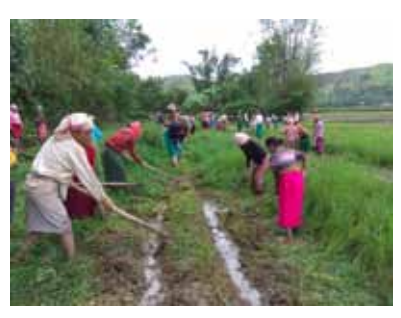
PAGE 03 Power of the Collective: Women from Thyamkongin working towards sustainable food security