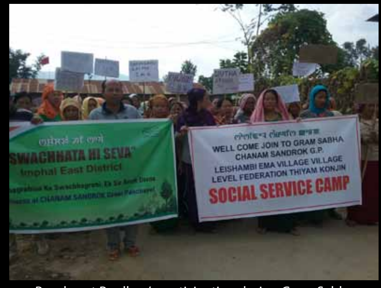
Panchayat Pradhan's participation during Gram Sabha mobilization in Chanam Sandrok G.P