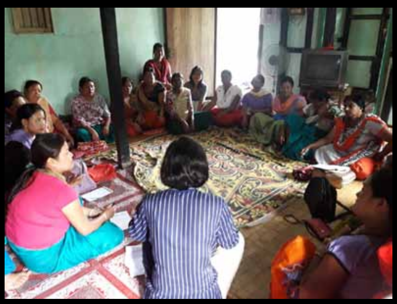
Meeting with the AAW, ASHA conducted by VLF about GPDP & Gram Sabha