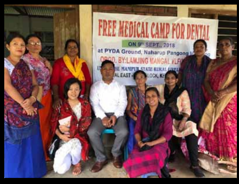
Free Dental Camp organised by Lamjing Nagpal VLF at PYDA ground, Naharup Pangong