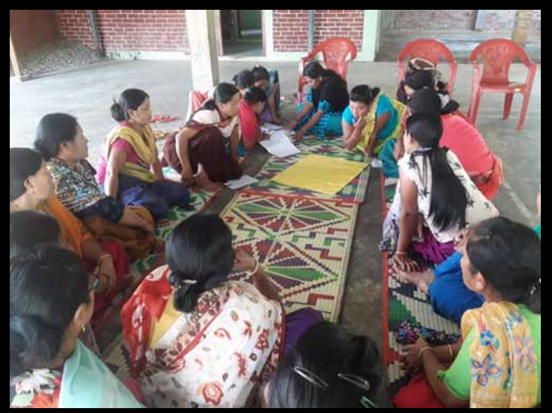
Demand consolidation at VLF