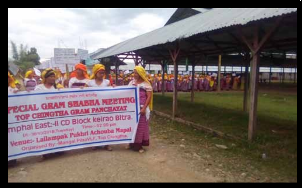
Special Gram Sabha Mass Rally at Top Chingtha G.P