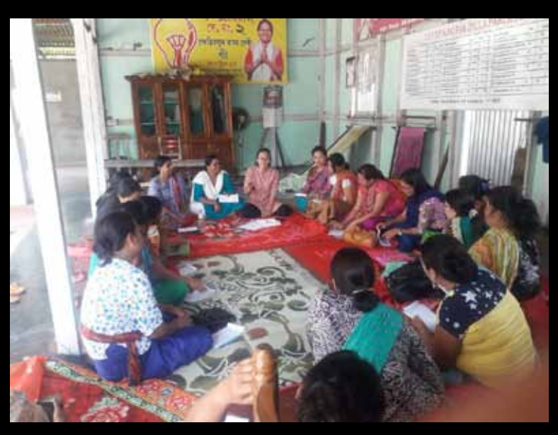
Orientation on GPDP at VLF level in Top Naoria G.P, Keirao-Bitra Block